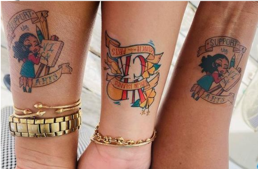
VICA staff wear their temporary #SupportTheArts tattoos