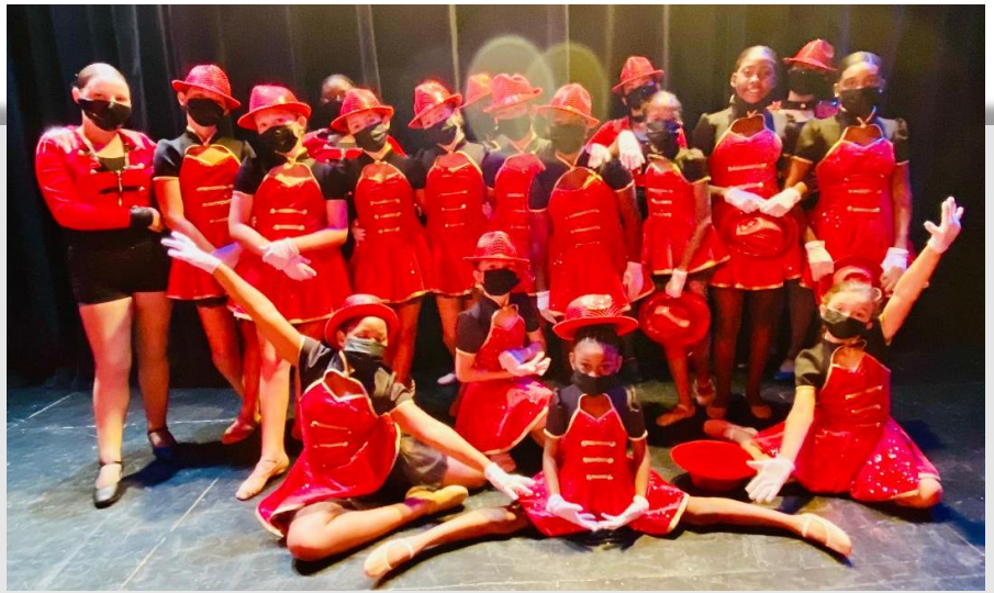
French Ballet Theatre Inc, a VI Council on the Arts grantee in FY 2021.

Although FY 2021 was interrupted by the COVID-19 pandemic the Virgin Islands Council on the Arts was able to advance its mission "to enrich the cultural life of citizens of the Virgin Islands through leadership that preserves, supports, strengthens, and make accessible, excellence in the arts to all Virgin Islanders.