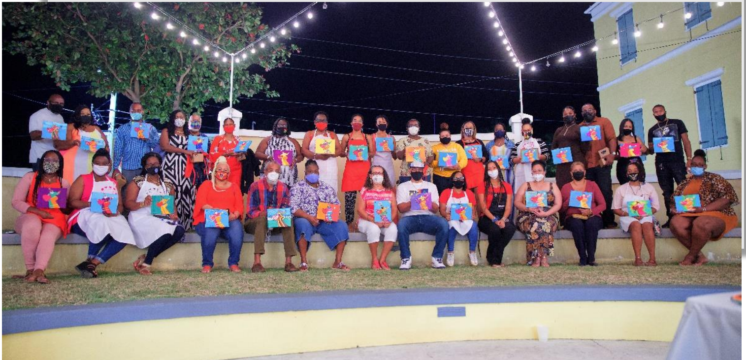
Attendees of VICA's Valentine's Day Sip and Paint at the Dorsch Center

Couples Painting Class for Valentine's Day-VICA's second Sip and Paint was held on February 13, 2021.