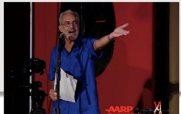
MC Papi Love