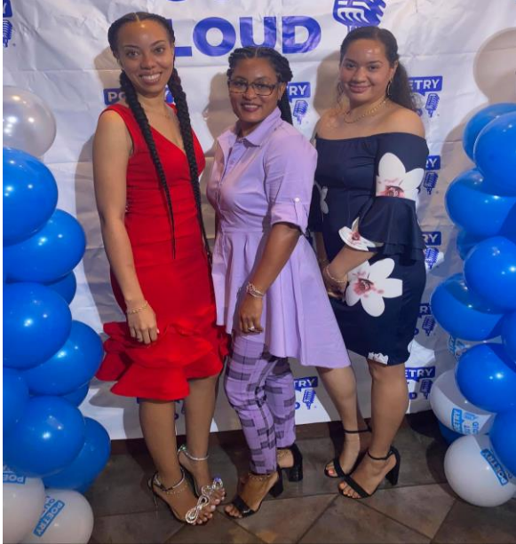
VICA staff at the 2021 (virtual) USVI POL territorial competition