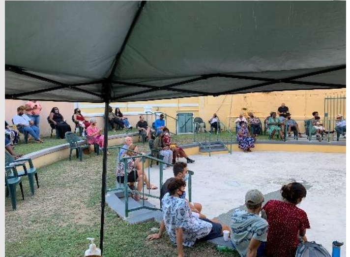
Attendees at VICA's Dorsch After Dark event

In FY 21 VICA's Dorsch After Dark Series was created. The goal of the Virgin Islands Council on the Arts is to highlight an artists' talents and provide the opportunity for exposure of their art to the community and physical space at the Dorsch Center to network, with other artists and the community. VICA's objective is to promote each artist's talent. Thus, VICA strives to interview each artist beforehand, and create a profile on them. Their profiles are then shared across our various social media platforms, with the artist's permission, to give broader exposure to showcase their talent. The artist has the choice of also displaying their art for sale, through the one-night-only pop-up shop, held at the Dorsch Center.