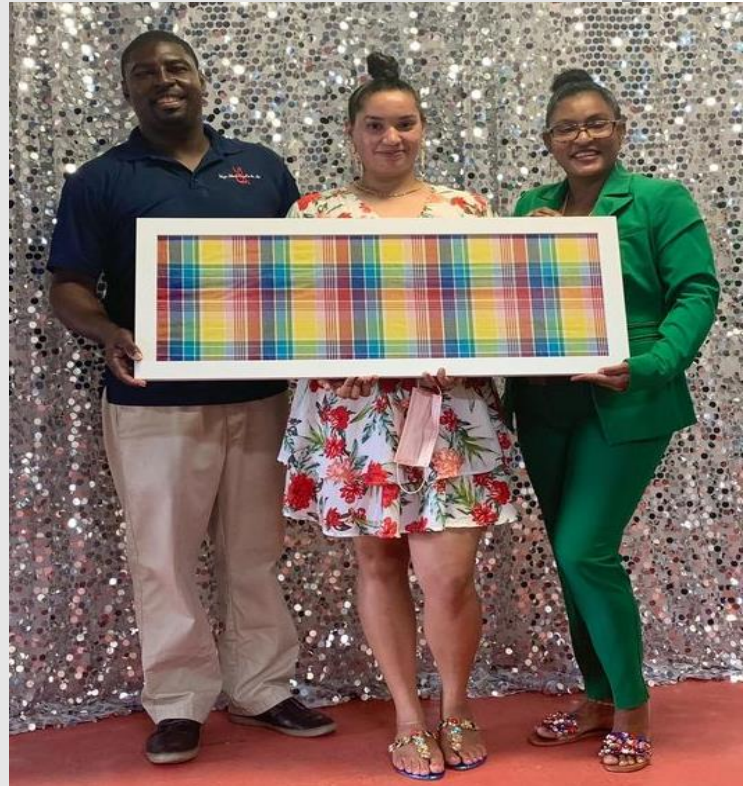
VICA's staff at the official madras unveiling ceremony