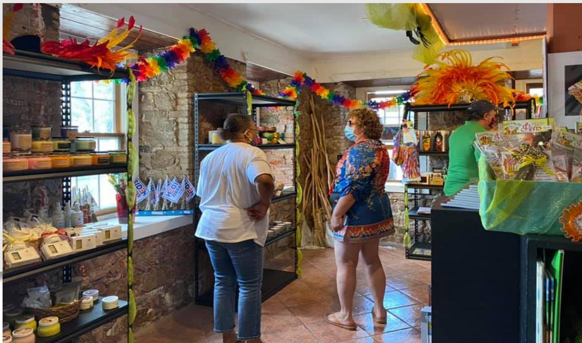
Shoppers inside the Made in the USVI Pop-Up shop on St. Thomas

In FY 21 the Virgin Islands Council on the Arts continued its partnership with the V.I. Economic Development Authority's Enterprise Zone Commission to extend the Made in the USVI Pop-Up shop on all three islands. Stocked with 100% locally made products from the U.S. Virgin Islands, the pop-up shop coordinated a special opportunity for locals and tourists to select locally made home decor items, clothing, soaps, body lotions, spices, seasonings, jewelry, accessories, books and tasty treats. The array of items represents approximately 30 homegrown artisans and small manufacturers operating on St. Thomas, St. John and St. Croix.