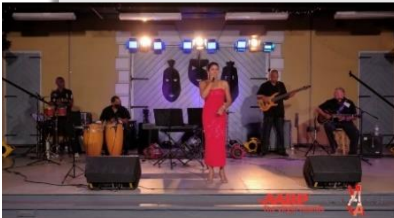
Romanza Band performing at VICA's V.I. - Puerto Rico Friendship Day concert