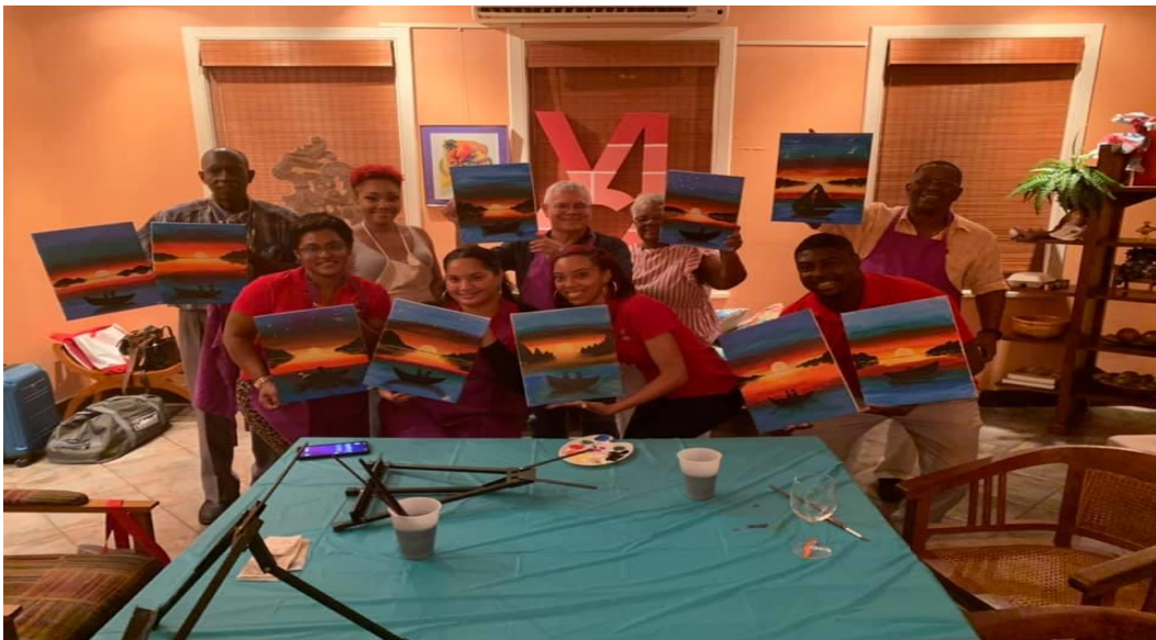
VICA Annual Board Retreat Sip and Paint